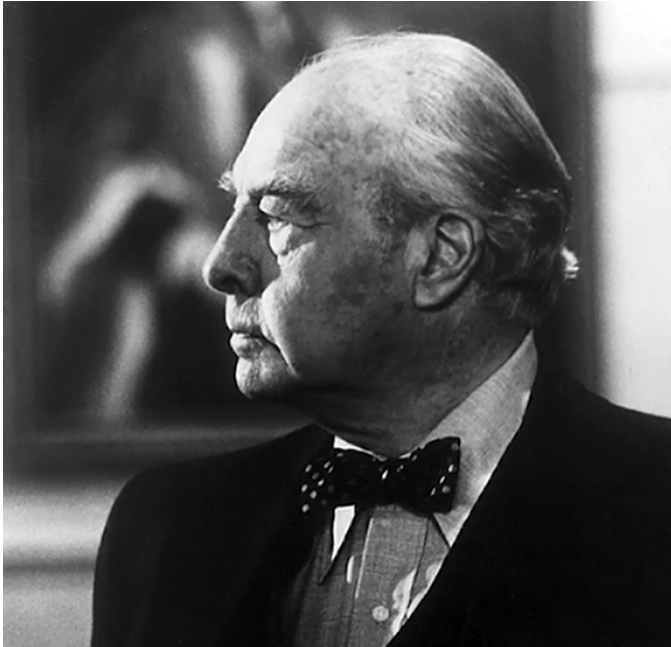
20th Century Fox Film