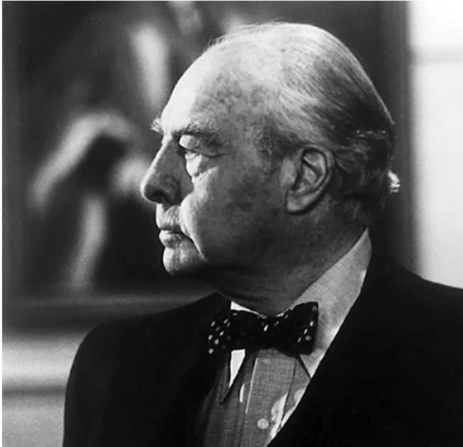
20th Century Fox Film