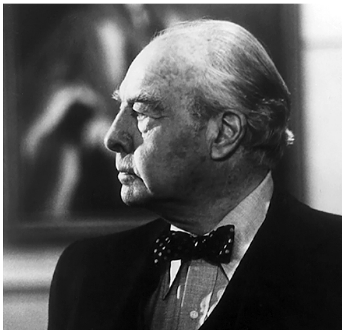
20th Century Fox Film