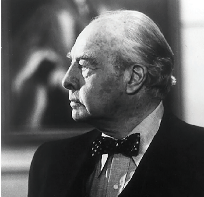
20th Century Fox Film