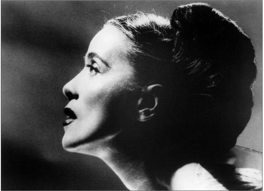
Martha Graham in Herodias.