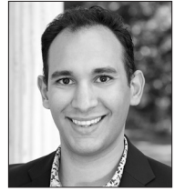
• Jerome L. Green Fellowship